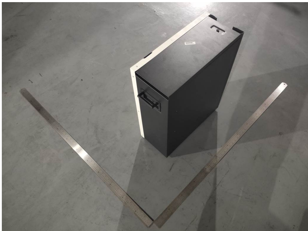
Figure 2 Overall view II of battery (电池图II)