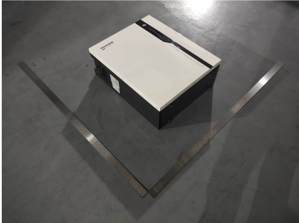
Figure 1 Overall view I of battery (电池图I)